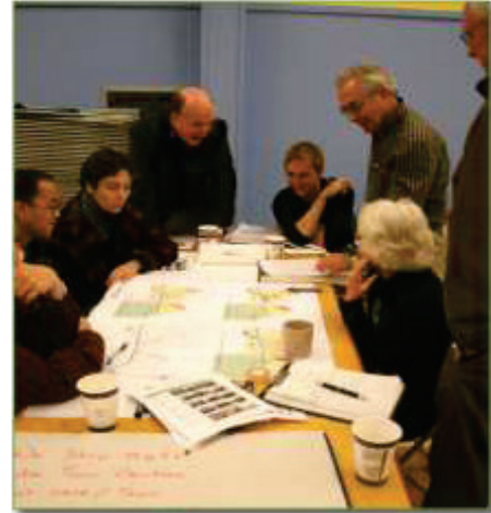
Community members participate in the "Options for the Future" workshop.

The Town is endowed with unique natural environments – Thetis Lake Park, Millstream Creek, Craigflower Creek, Esquimalt Harbour and Portage Inlet. The integrity and beauty of these natural amenities are protected and enhanced, while public access to recreation and natural areas is improved. The Town's vast recreation assets are well promoted and integrated into the community. Environmental stewardship and better use of resources – such as alternative energy generation and enhanced waste management – are pursued.