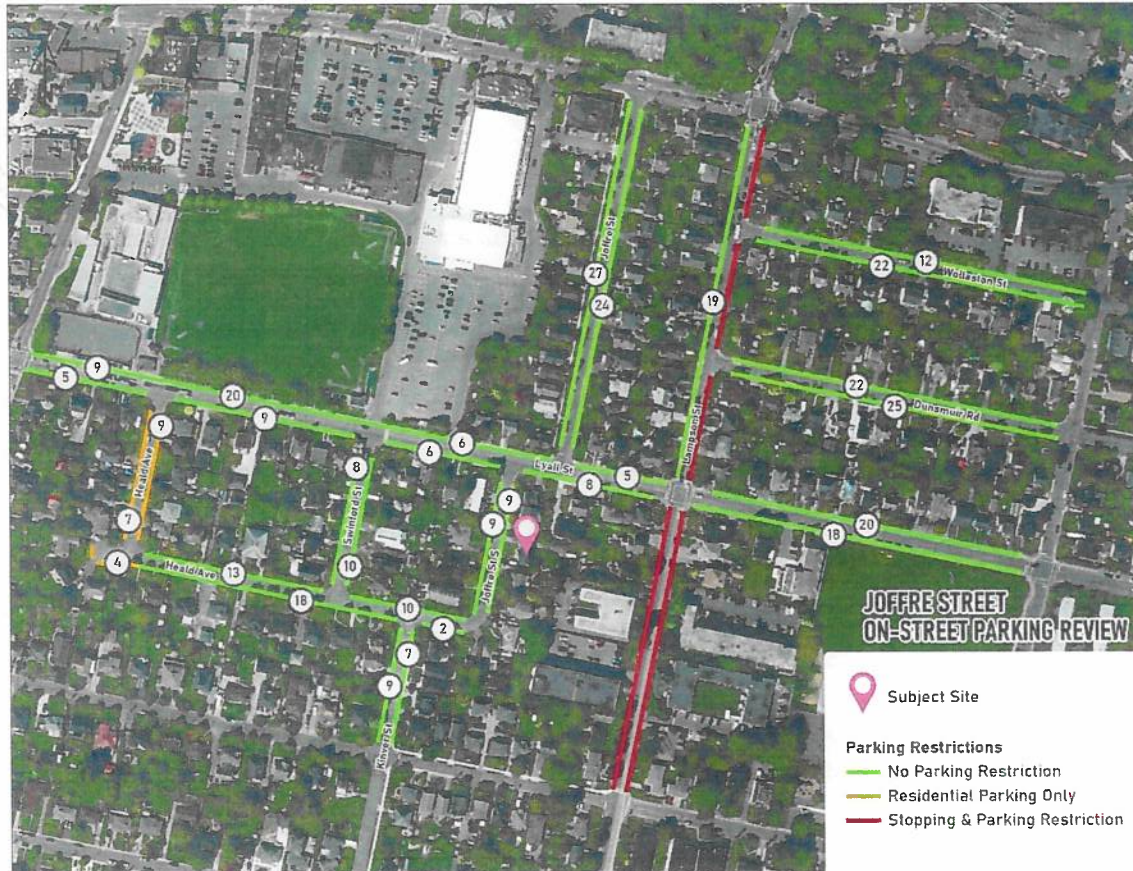
Figure 1 – Overview of On-Street Parking Supply and Restrictions near the Subject Site