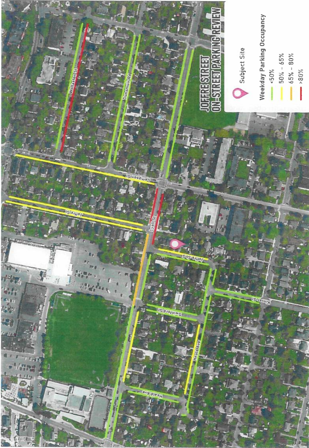
Figure 2 – Weekday On-Street Parking Occupancy (March 8, 2022)