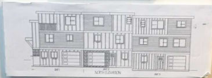
NORTH ELEVATION 08/1