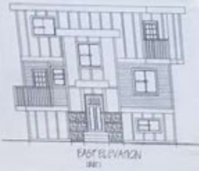
EAST ELEVATION 08/1