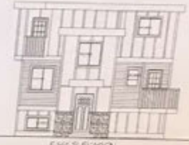
EAST ELEVATION 08/1