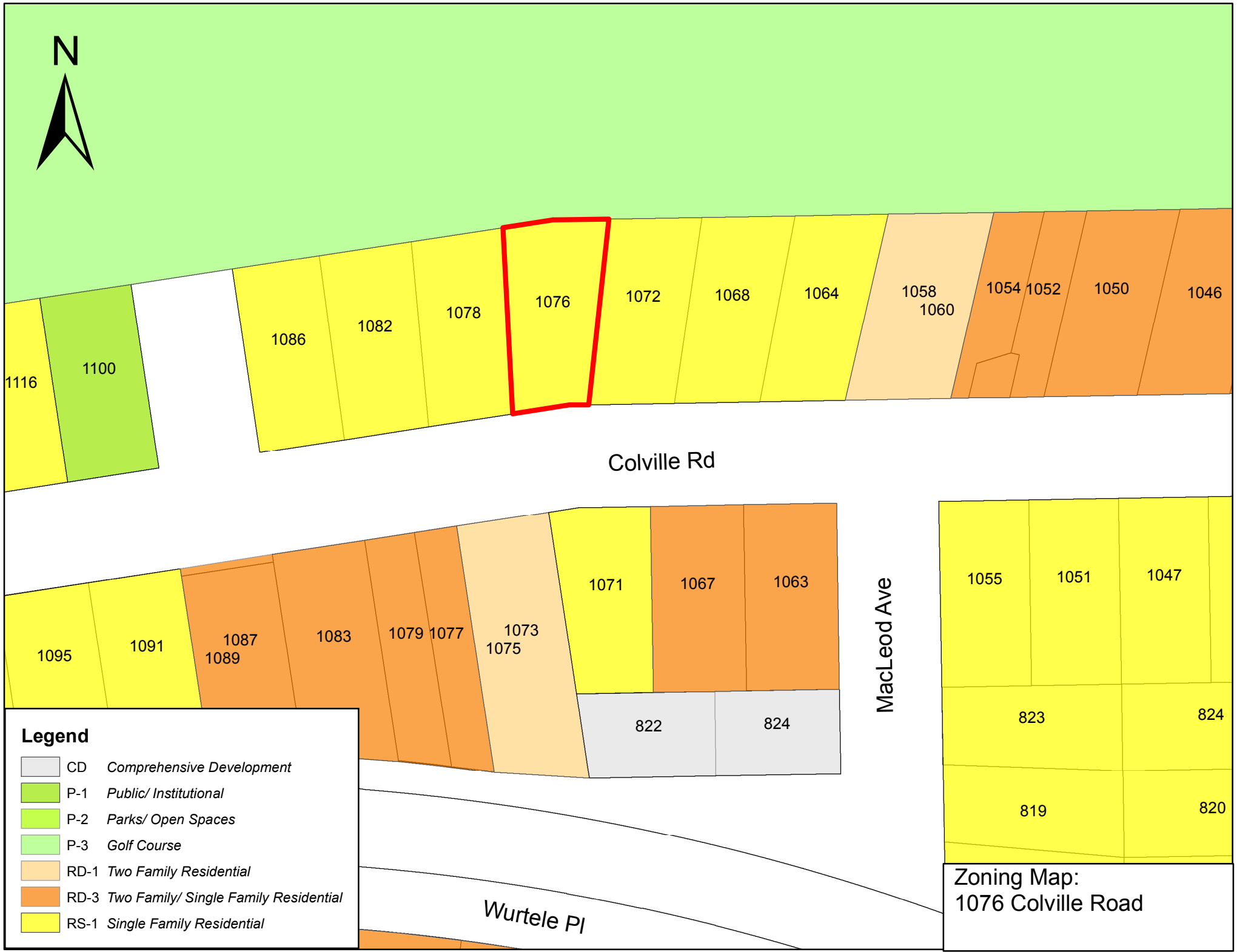
Zoning Map: 1076 Colville Road