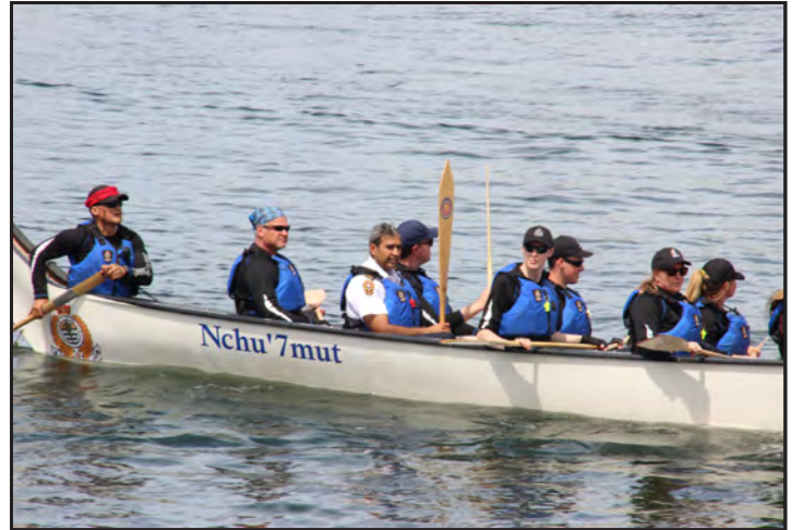
The 2018 Pulling Together Canoe Journey brought together paddlers from across the community