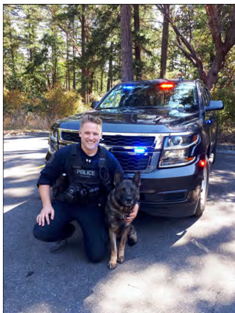
VicPD's K9 units are major contributors to our patrol response capability

In mid-July, officers responded to the 600-block of Head Street after a man followed a victim that was known to him and sexually assaulted her at her residence. Officers recognized that the man matched the description of a person of interest who was reported to be masturbating at a bus stop a few days earlier. The male was charged with sexual assault, and the victim attended the Sexual Assault Centre for examination. The scene was also secured and Forensic Services was called out to photograph the scene and collect further evidence.