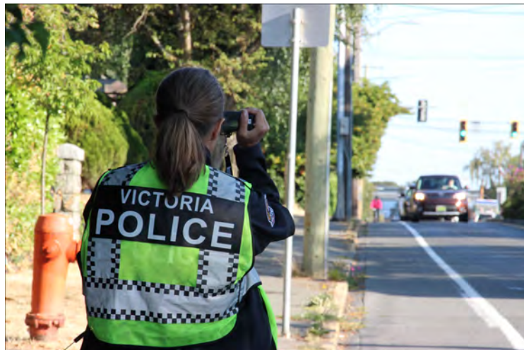
A VicPD officer keeps an eye out for speeders as part of VicPD's Back to School campaign