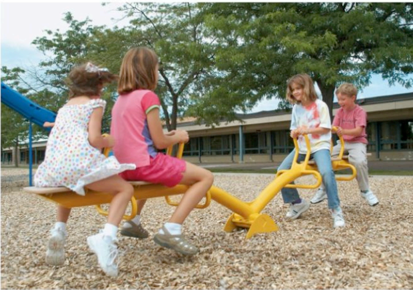
SEESAW REQUIRES 4.115m x 6.58m SAFETY SURFACE SURROUND