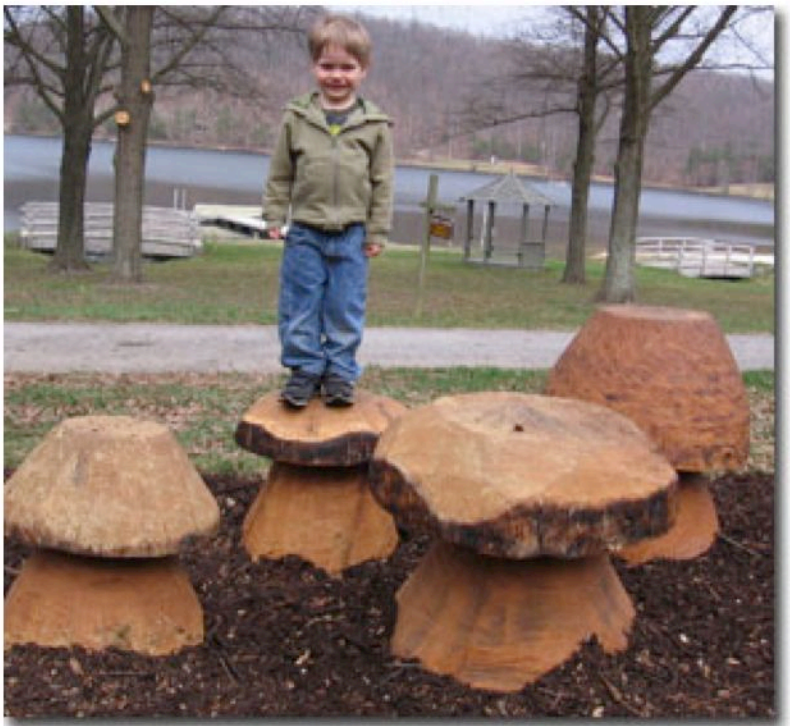
WOOD MUSHROOMS NEED TO BE SPACED 1.85m APART WITH SAFETY SURFACING EXTENDING 1.85m BEYOND MUSHROOM