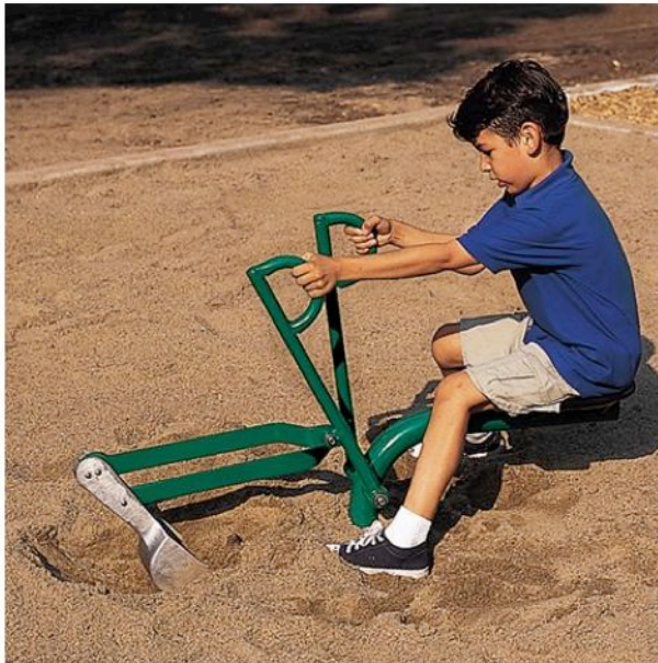
SAND EXCAVATOR IN SAND PIT