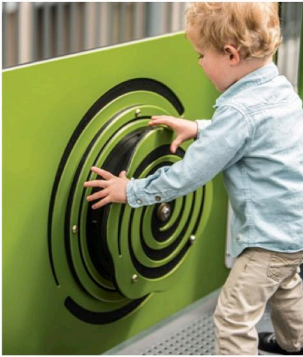
RAIN SOUND PANEL