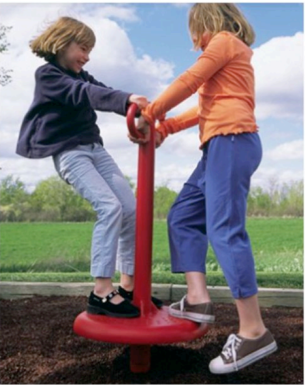
SMALL SPINNER REQUIRES 4.27m DIAMETER SAFETY SURFACE SURROUND