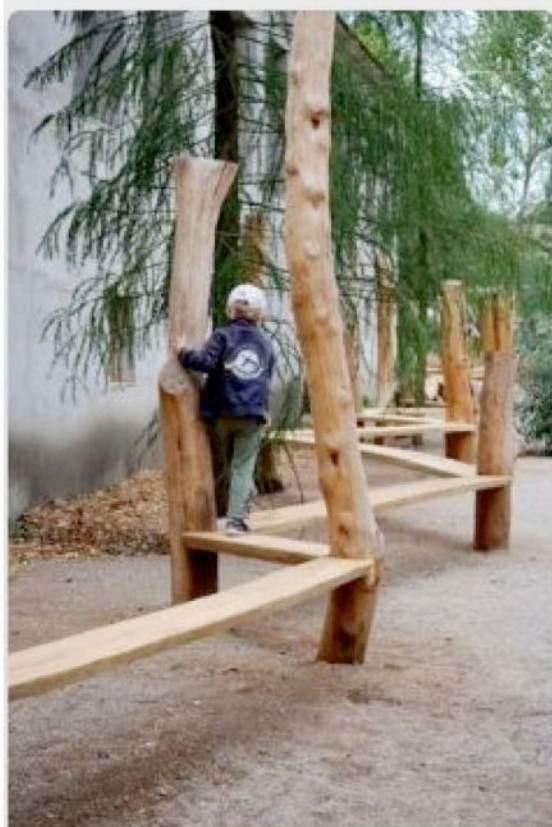
PLANK BRIDGE WOULD NEED TO BE SET LOW TO THE GROUND