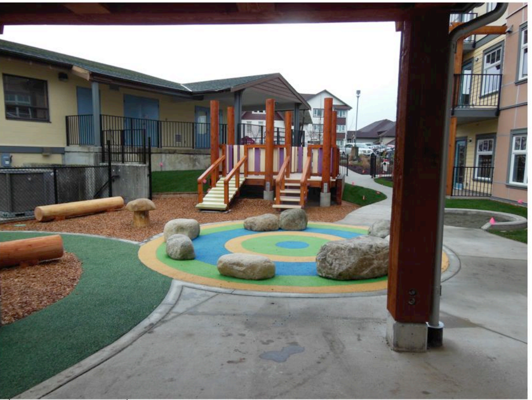
RECENTLY COMPLETED ACTIVITY PLAY DECK (ROOF NOT INSTALLED) IN SUPERVISED DAYCARE PLAY AREA