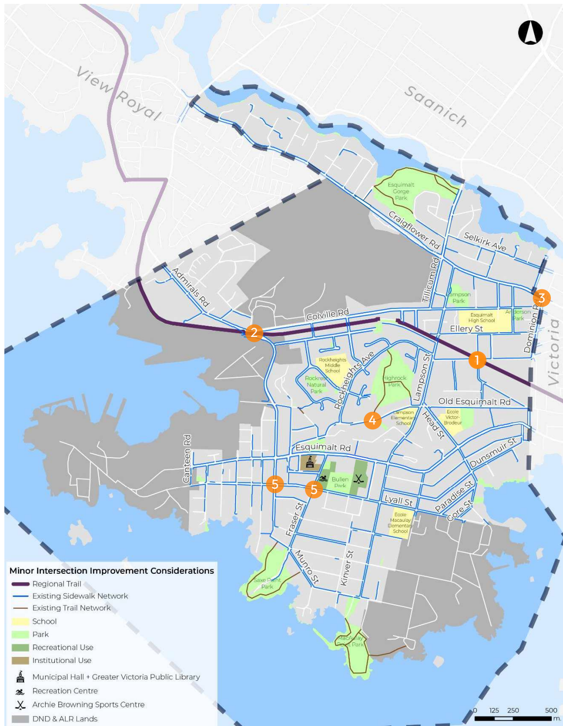
Short-Term Minor Intersection Improvements Considerations