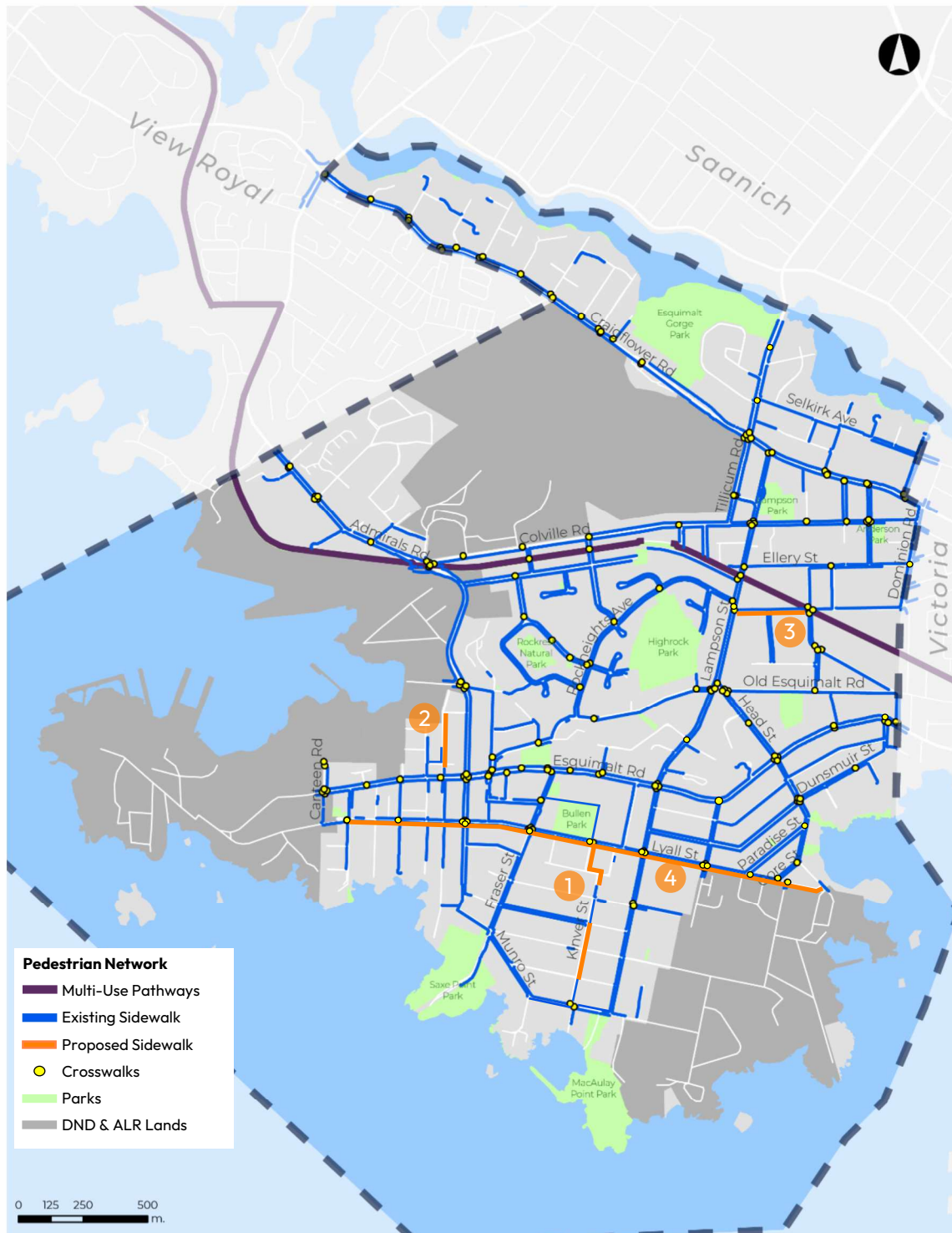
Short-Term Pedestrian Improvements