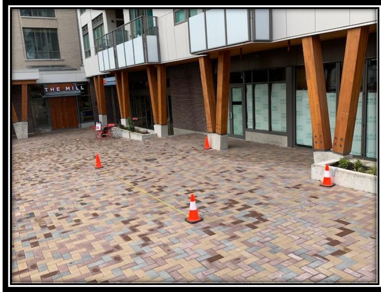
Figure 1 Pylons delineate the approximate exterior boundary of the proposed plaza patio.