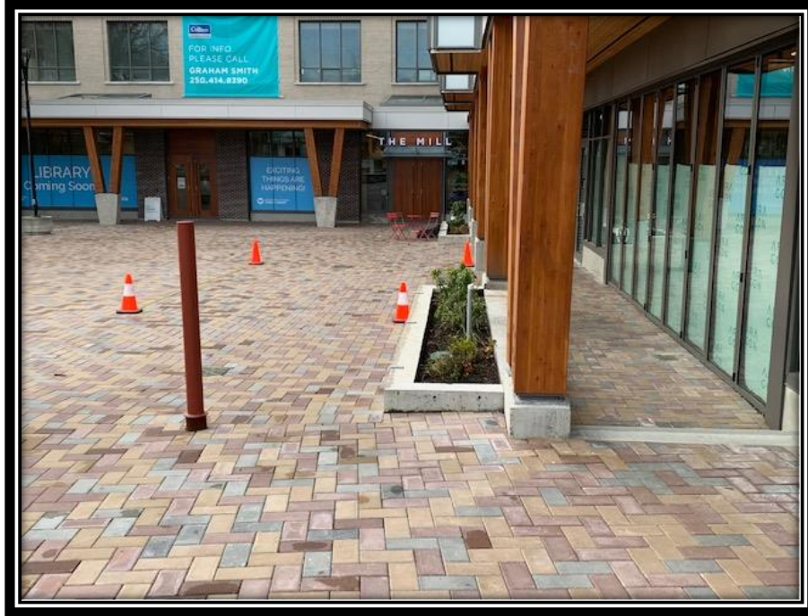
Figure 3 Proposed plaza patio location in relation to the arcade patio space.