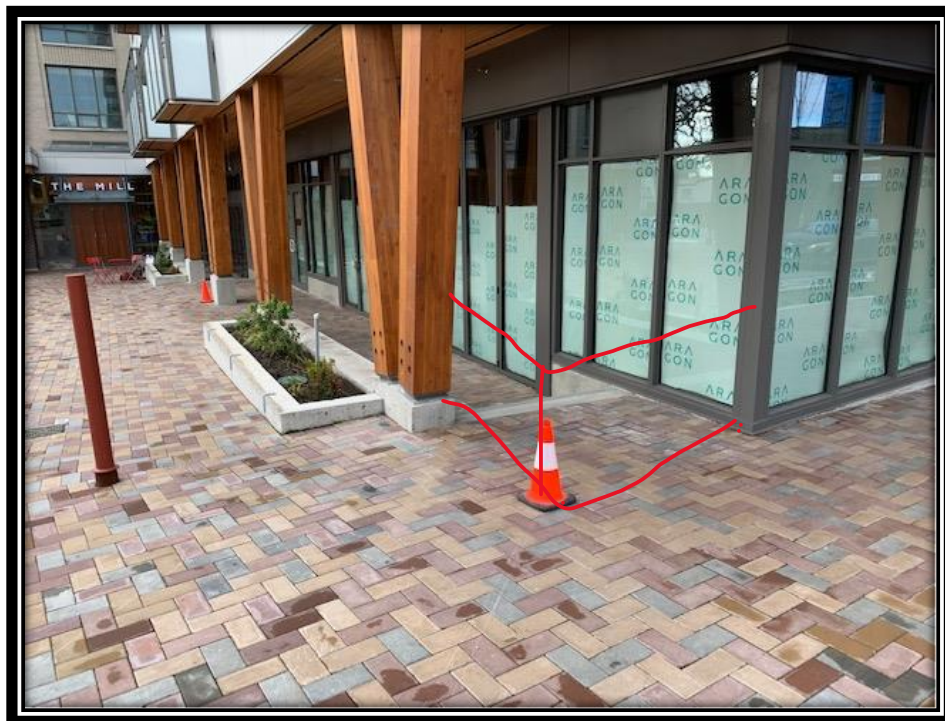
Figure 4 A fenced gated area to access the arcade space will be located at the corner of the restaurant extending to the pylon.