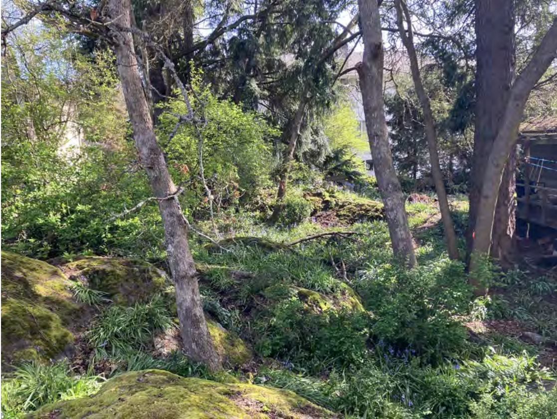
Figure 3: 903 Admirals Road; northwest yard corner, undulating bedrock outcrops / broad areas of deeper soil between, April 10, 2024.