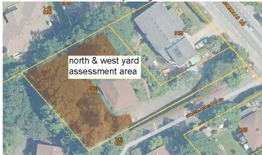
Figure 1: 903 Admirals Road; north and west yard vegetation assessment area.