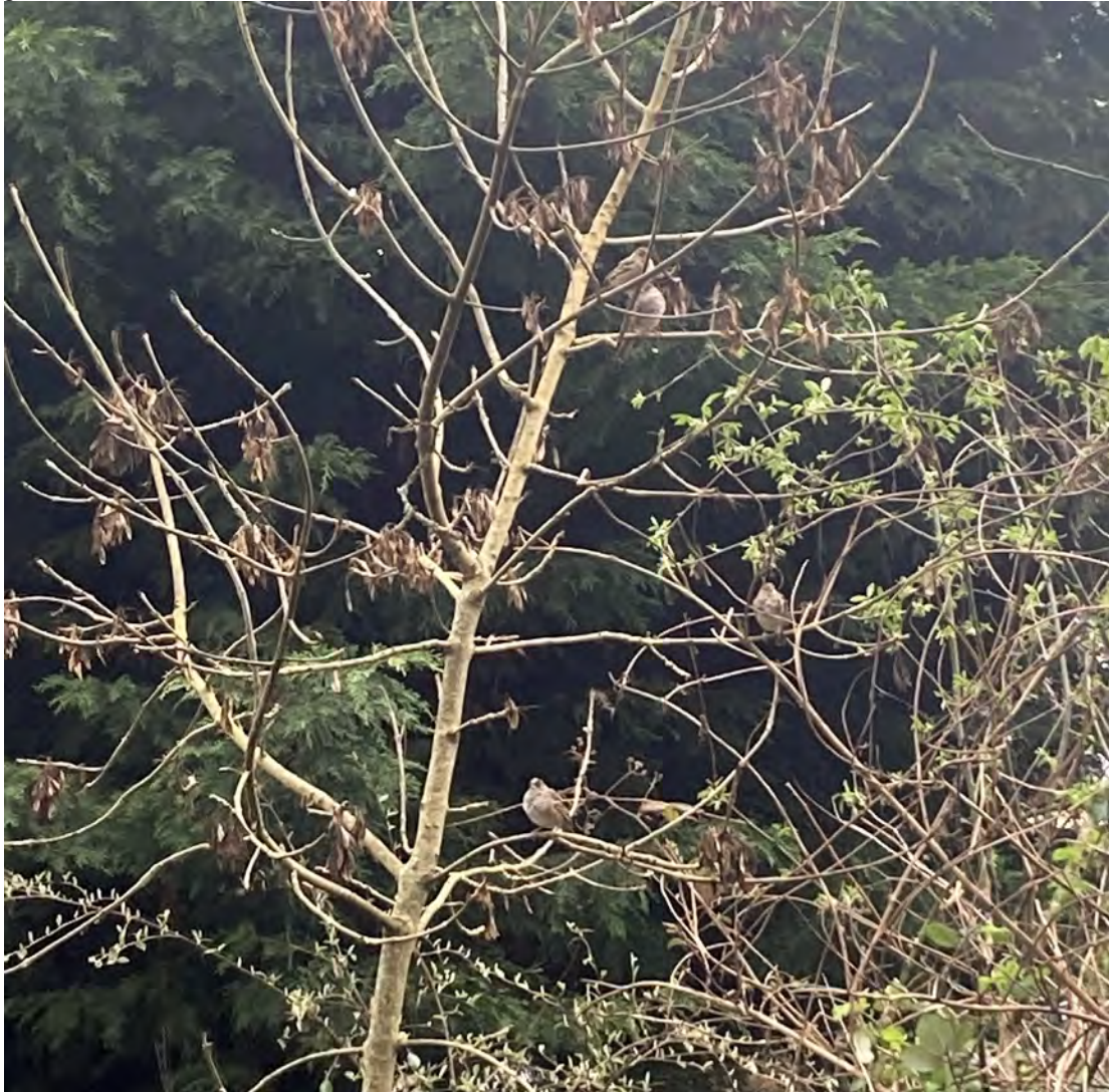
Figure 8: 903 Admirals Road Sparrow flock, March 27, 2024.

Other than Deer scat CJF saw no other mammal sign between March 27 and April 10, 2024. Song birds present, woodland sheltering Song Sparrows observed March 27, 2024 (Figure 8). Obvious bird nesting behavior not observed – assessment site visits early in Greater Victoria March 15 to September 15 nesting season.