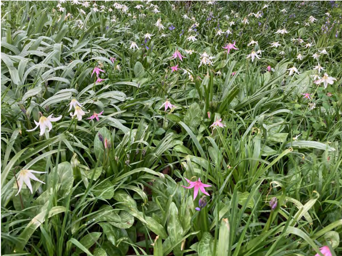
Figure 6: 903 Admirals Road, white and pink Erythronium mix, April 3, 2024.

Native shrub most abundant along north property line.