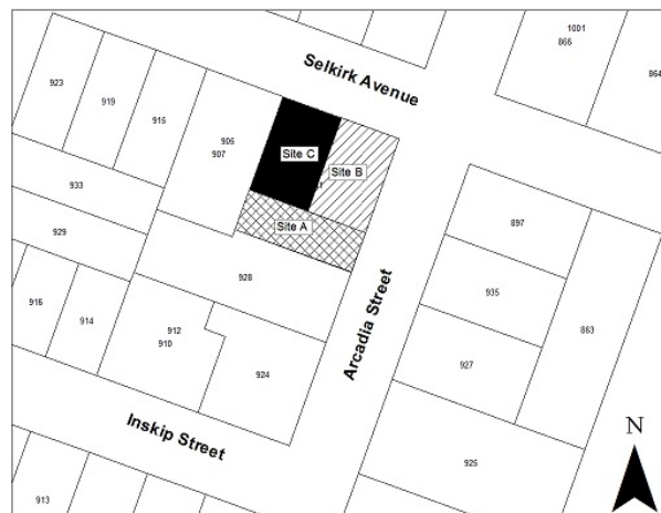
Figure 1. Site A, Site B, Site C

In that Zone designated as CD No. 118 [Comprehensive Development District No.118] no Building or Structure or part thereof shall be erected, constructed, placed, maintained or used and no land shall be used except in accordance with and subject to the regulations contained in or incorporated by reference into this Part.