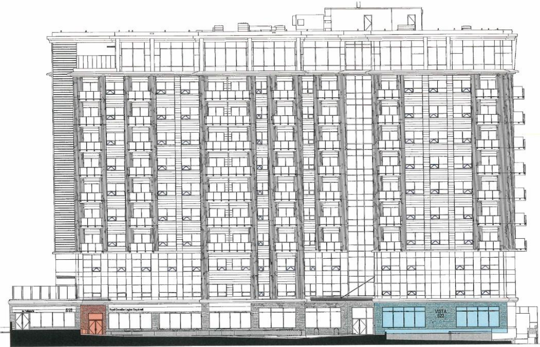
1 ADMIRALS ROAD ELEVATION A_CA 03 SCALE 1 : 250