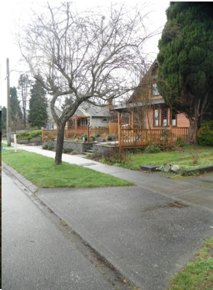
Figure 3 - Boulevard with separated sidewalk

In the pictures it can be seen that various types of surface infrastructure are located within the boulevard such as: