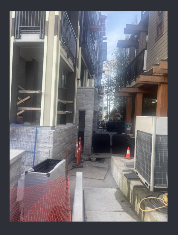
View South between Bldg 1 & Inn Wing