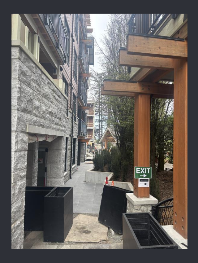
Building 1 Lobby to Inn Wing