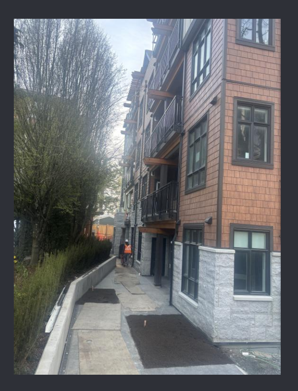
View North between Bldg 1 & Inn Wing (retaining wall lot line)