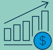
Engagement Total by Purpose

This period report summarizes actions and metrics in alignment with the 2023-2025 Economic Development Action Plan initiatives. Key indicators (engagement, projects, and use of funds) help measure the effectiveness and progress of the Action Plan.