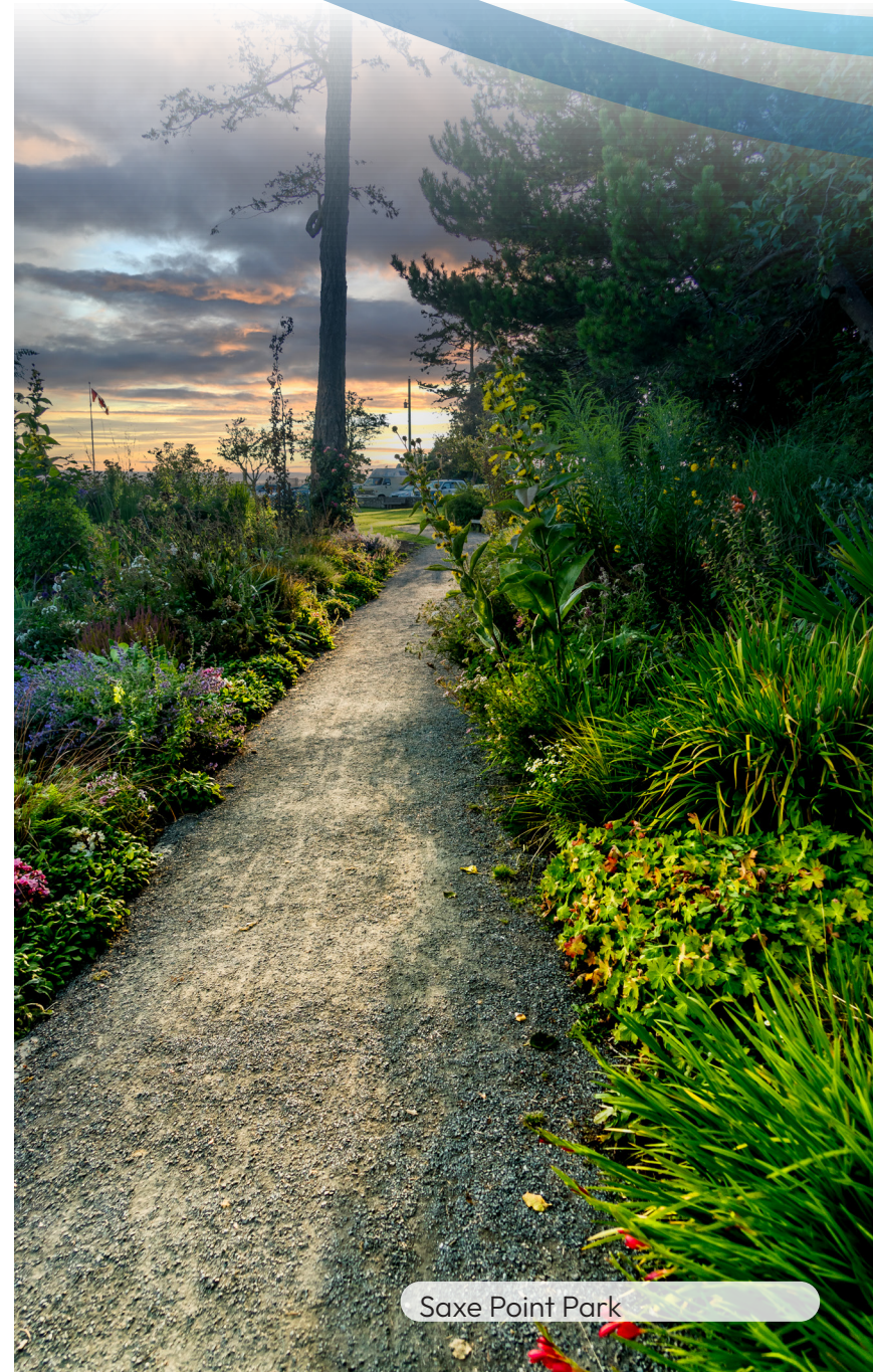
Saxe Point Park