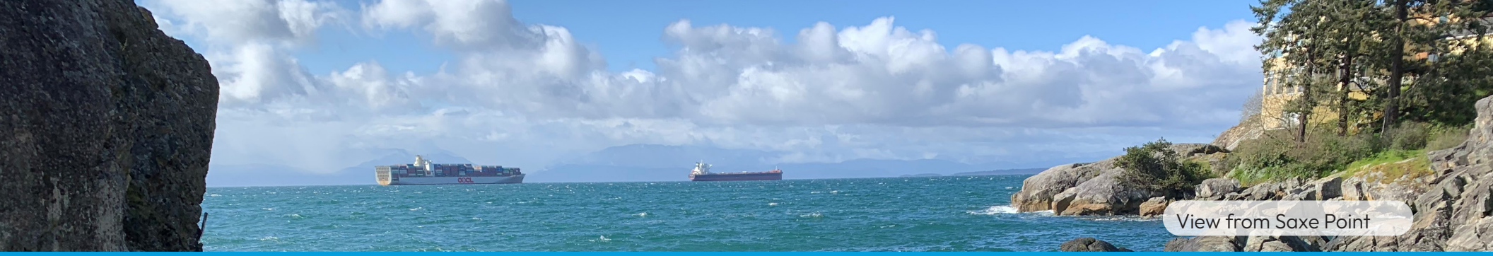
View from Saxe Point