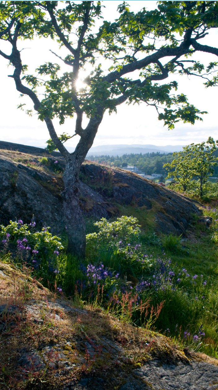
View from Highrock Park