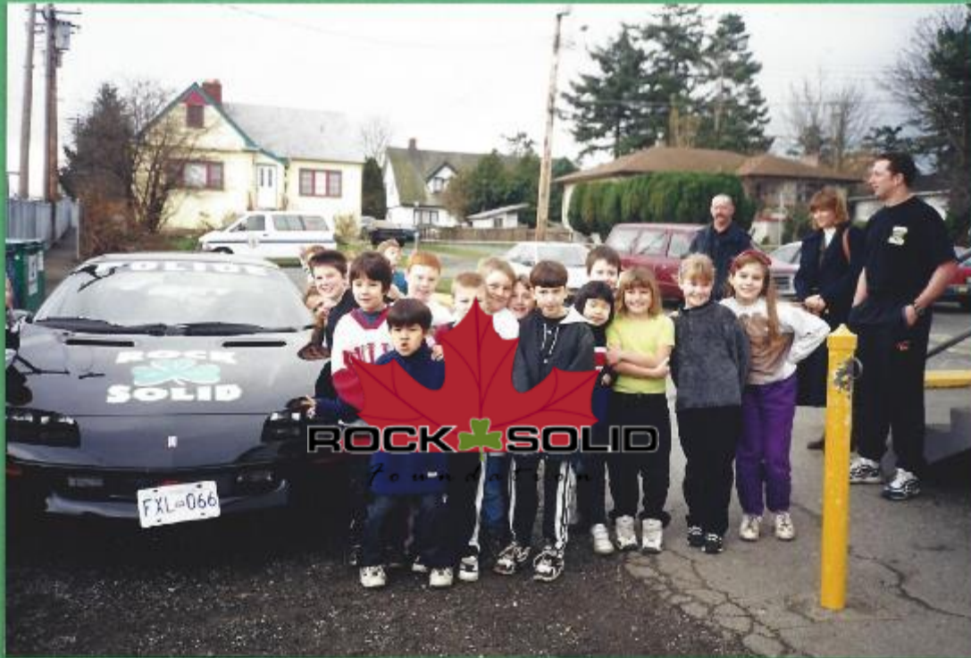
- The Rock Solid Car -