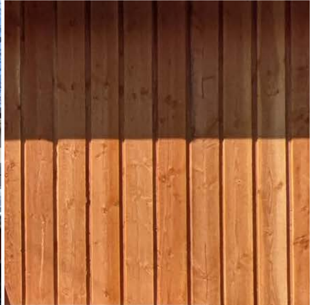
REVERSE BOARD AND BATTEN CLADDING

A half round gutter was designed to keep the roof profile as thin as possible. The galvanized metal helps the massing of the roof not read as heavy.