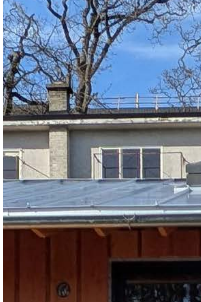
METAL ROOF & GUTTER

Black frame and a high reflectivity on the glazing for greater privacy.